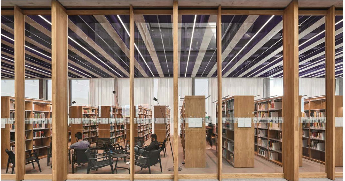
▲ INDUSILENT – FHNW-Campus, MuttENZ.