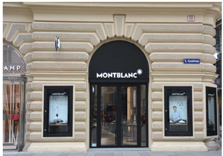
External view of the new Montblanc Boutique in Vienna.