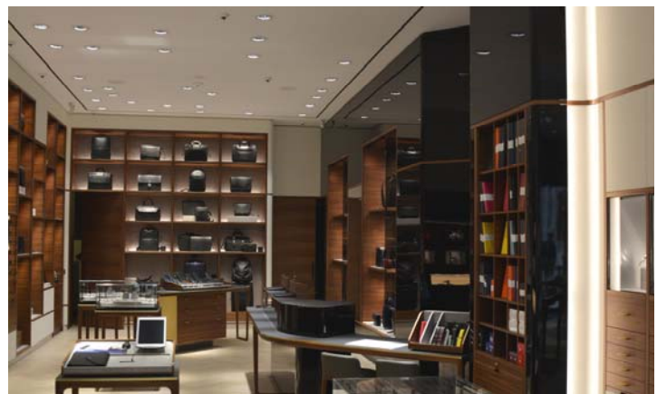
Showroom equipped with INDUL Linear Diffusers from Kiefer.