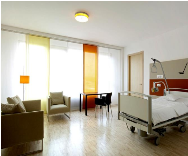
Patient's room with 4-star standard